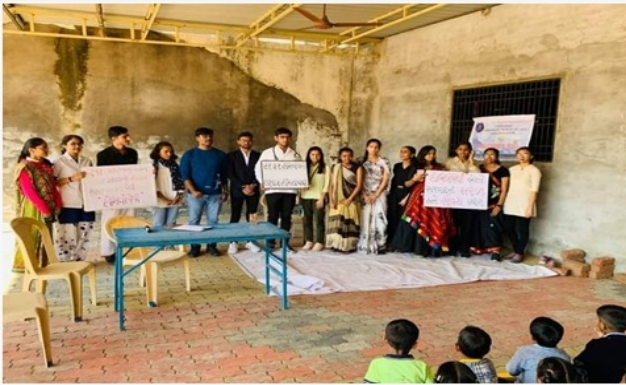
As a Part of Azadi ka Amrit Mohotsav Homoeopathy Awareness Drama (20/12/22)