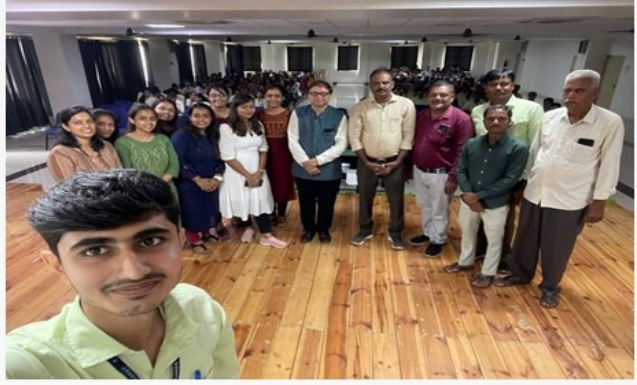
As a Part of Azadika Amrut Mahotsav (5/8/22) (We Honoured Farmer & Solder)