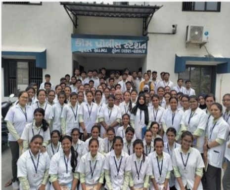
Forensic Medicine & Toxicology Visit - kim police station