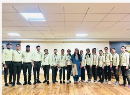
Seminar Symplying Rubric