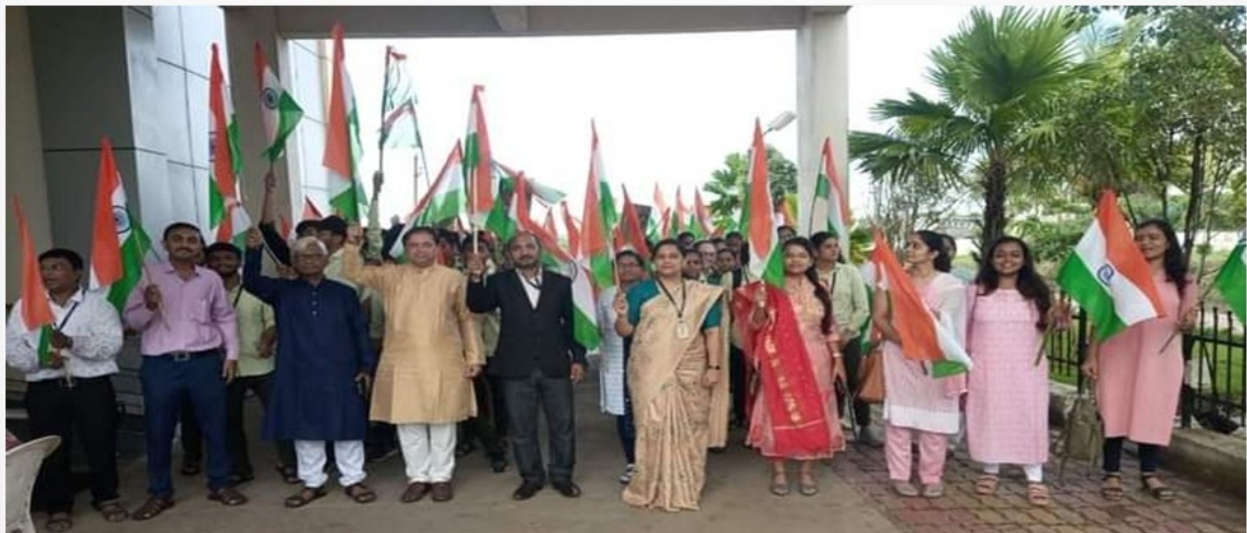
Tiranga Raly- 10/8/2022