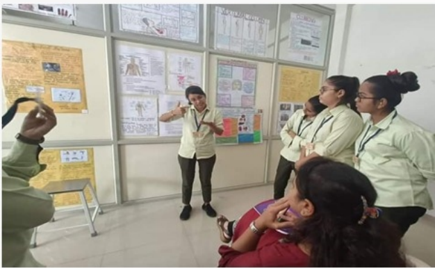
Chart Presentation Competition (6/10/22) Practice of Medicine