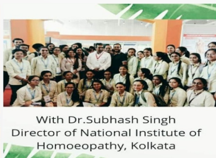
National Global Summit at Gandhinagar