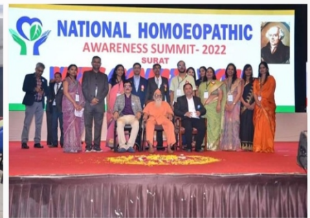
National Homoeopathic Awareness Summit at VNSGU